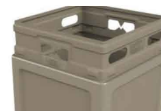
Grab Bag System